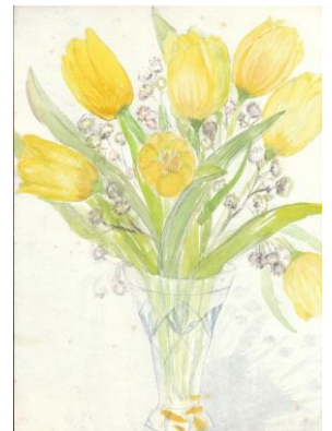
"Tulips" by Mollie Nye